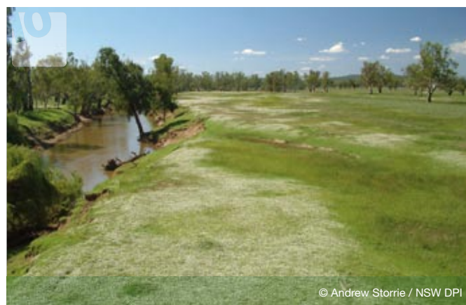
Flowering Lippia infestation along banks of Namoi River, near Boggabri, NSW, February 2004.