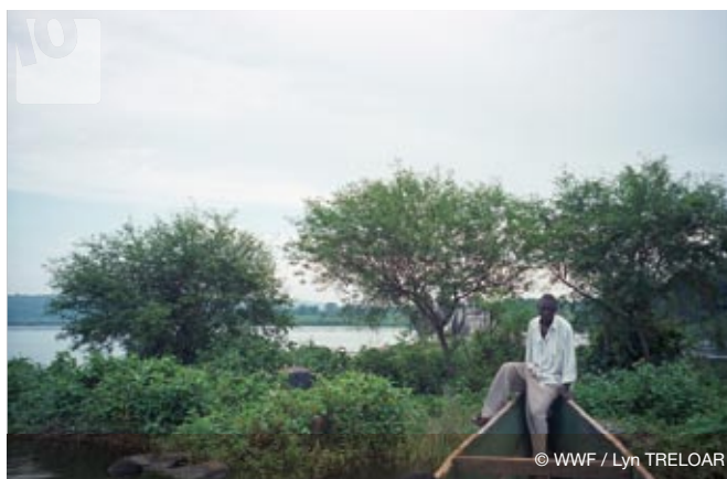
The Lake Victoria source of the Nile. The river originates from two distinct geographical zones, the basins of the White and Blue Niles.

In the Mara river watershed in Kenya and Tanzania, which drains into Lake Victoria, WWF is facilitating stakeholder dialogue on integrated river basin management for regional and district government institutions, non-governmental organizations and communities. This includes work to: protect the forest sources of the river on the Mau escarpment, model environmental flows, and develop water sharing agreements needed to sustain people and nature along the river.