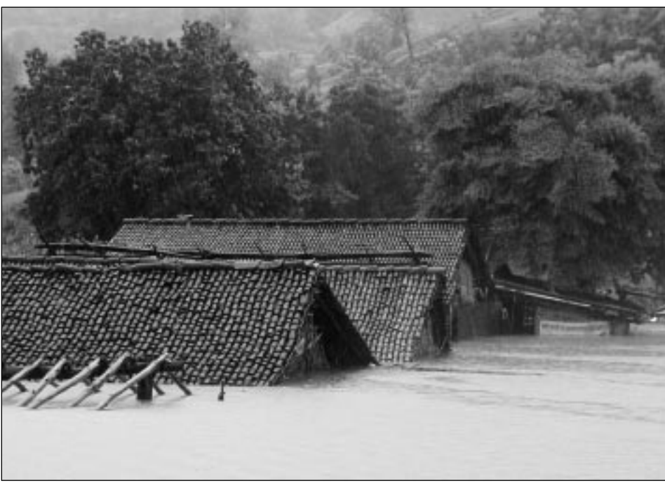
Houses submerged by Sardar Sarovar reservoir, India.