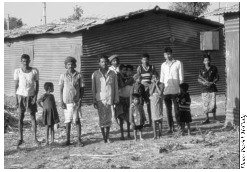
Resettlement site for Sardar Sarovar Dam, India.

World Bank research published in 1996 found that inflation-adjusted cost overruns on 66 hydropower projects funded by the Bank since the 1960s averaged 27%. This compares with average cost overruns on World Bank thermal power projects of 6% and on a sample of over 2,000 development projects of all types of 11%.<sup>5</sup>