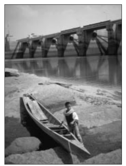
Thailand's Pak Mun Dam has harmed the livelihoods of thousands of fishing families.

The project pipeline for the Kyoto Protocol's Clean Development Mechanism illustrates how large hydros could capture the bulk of funds available to promote renewables. A single hydro project in Mozambique, the 1,300MW Mphanda Nkuwa dam, is proposing to sell seven million tonnes of carbon credits per year under the CDM.<sup>4</sup> Over 21 years (the maximum period over which supposed emission reductions can be claimed) Mphanda Nkuwa would generate 147 million credits.