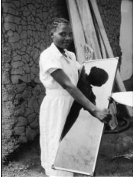
. Rural Kenyan woman holding her new PV panel.

Fortunately there are a raft of new renewable technologies (see box) which can provide clean, appropriate and efficient energy to the world's poorest, helping to eradicate poverty without costing the earth. Realizing the potential of these "new renewables" is vital if we are to achieve the UN's Millennium Development Goals of halving extreme poverty and hunger by 2015 and reversing environmental degradation.